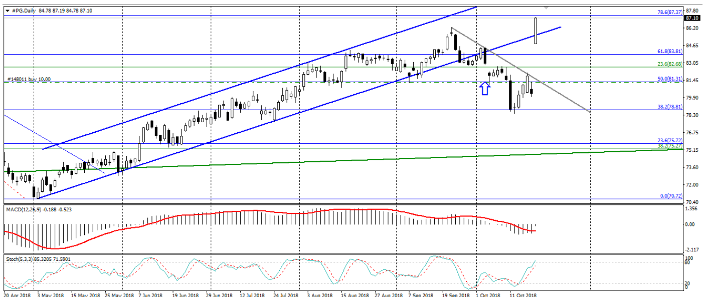
P & G shares chart. The current price is 87.10.

It caused the rapid growth of the company's shares, which thereby fully met the expectations of this investment idea.