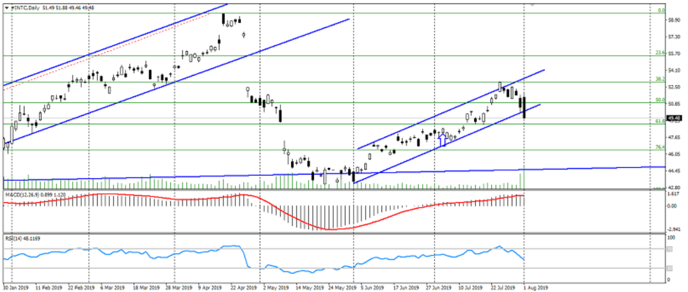
Intel Shares Chart

The investment idea "Make Money on Intel Shares Growth" closes with the achievement of the first conservative goal and the risks escalation. The actual profit for this idea varies from 150 to 250 points.